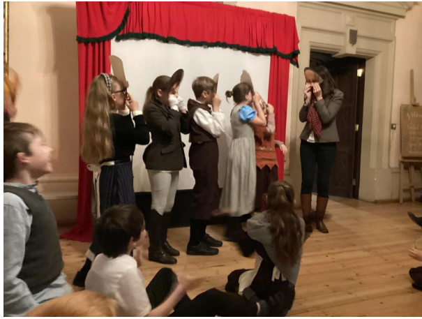
1 - Class 3 Newstead Abbey Trip