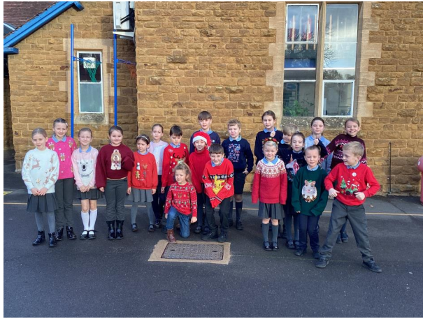
2 - Class 2