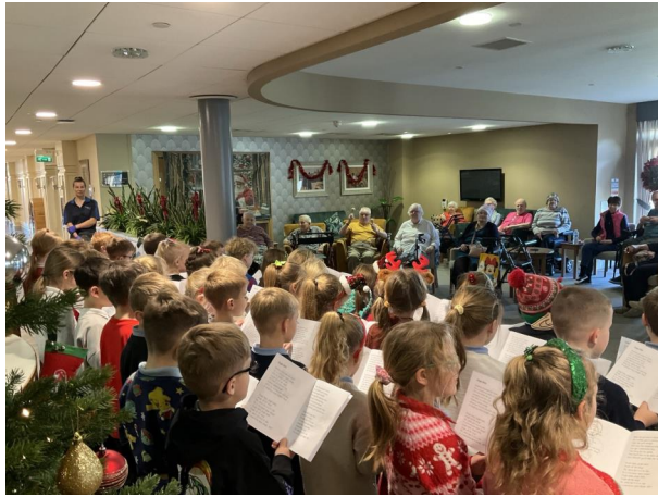
3 - Class 1 Activities